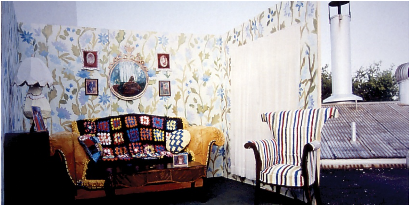
Fraserwood Ave., Apt #2, Factory Roof