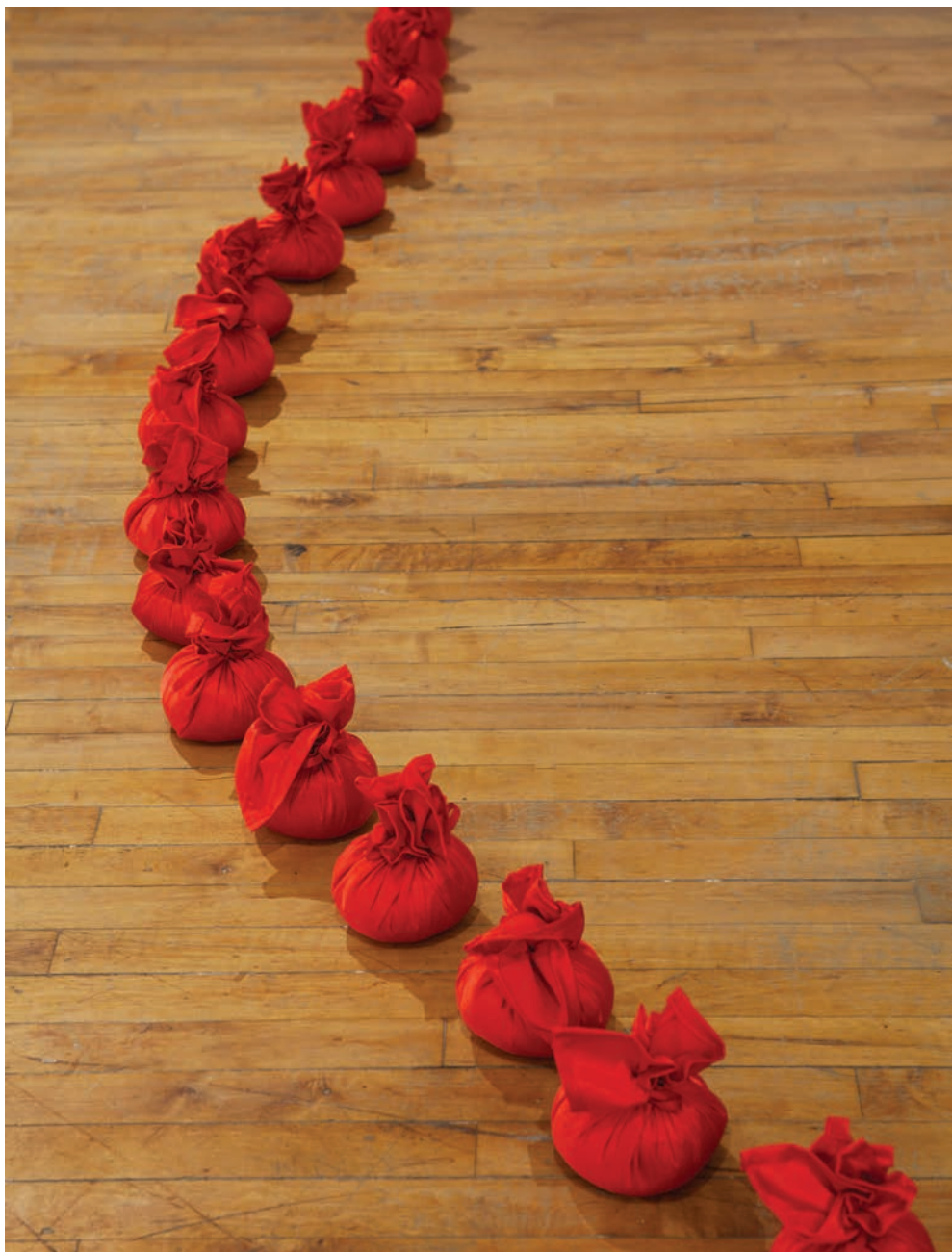
Come Home (detail), 2015, performance, four hours