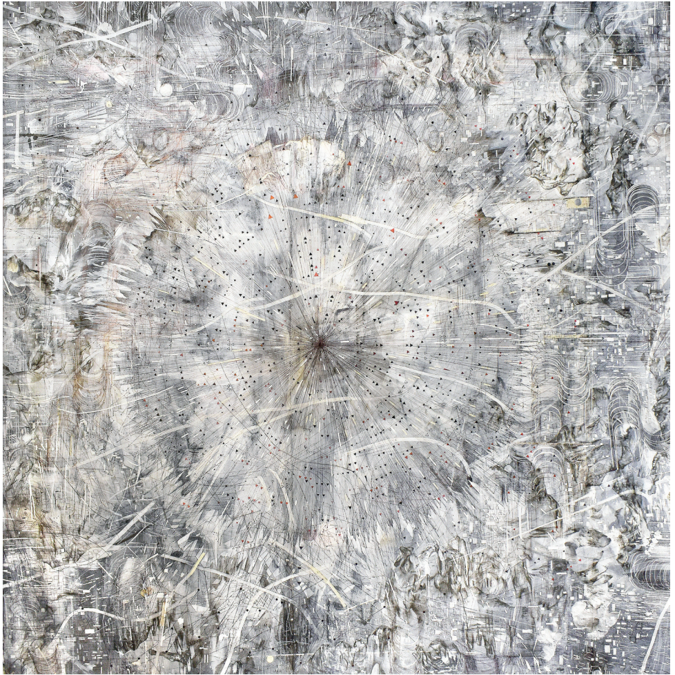
Amy Schissel Checkpoint Acrylic, graphite, charcoal and ink on paper 98 X 98 inches 2020