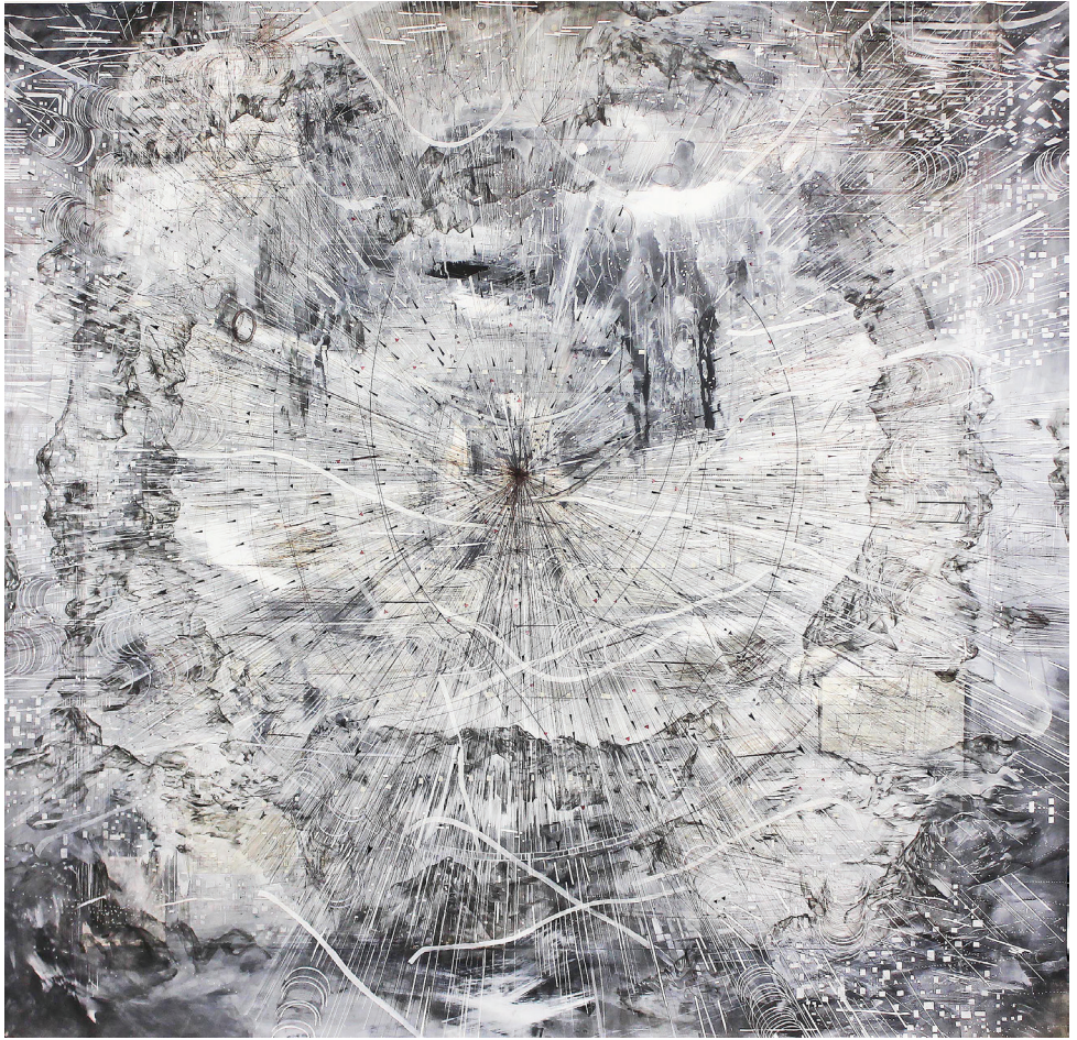
Amy Schissel As the Crow Flies Acrylic, graphite, charcoal and ink on paper 98 X 98 inches 2020