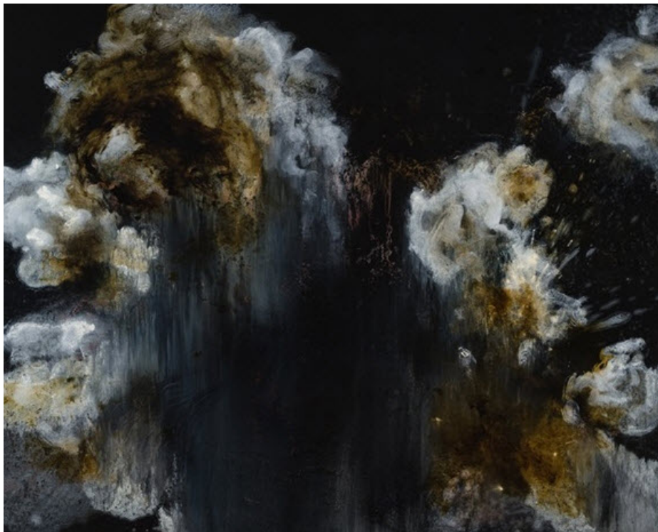
Carol Bernier, Portrait d'une enfance no.2 (2016).

Exhibition: “ Shannon Craig Morpew: Traveling the Landscape ( http://www.artnet.com/galleries/loch-gallery/shannon-craig-morpew-travelling-the-landscape/ ).”