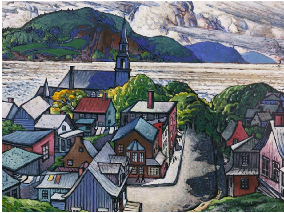
Marc-Aurèle Fortin, Bagotville (1948).

Exhibition: “Collector’s Choice ( http://www.artnet.com/galleries/oeno-gallery/collectors-choice/ )”