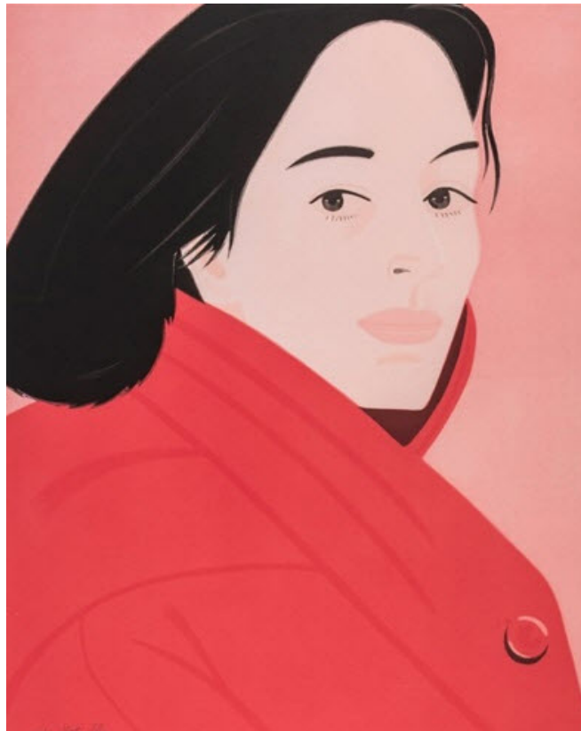
Alex Katz, Brisk Day II (1990).

Where: Oeno Gallery, 2274 County Road 1, Prince Edward County, ON, Canada