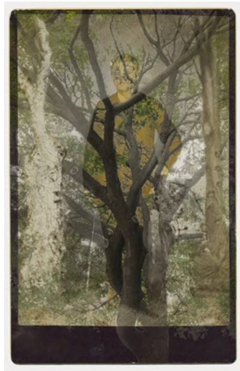
Sara Angelucci, Man/Maple (2016).

Exhibition: “ Sara Angelucci Arboretum ( http://www.artnet.com/galleries/stephen-bulger-gallery/sara-angelucci-arboretum/ .)”