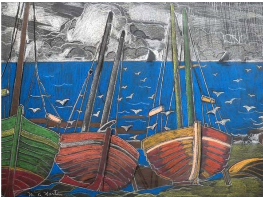
Marc-Aurèle Fortin, Les barques (1942).

migrate north—that being said, it shouldn't be the only reason why “Canada” and “how do I move to Canada” has spiked in Google searches. Art Toronto opens its doors tomorrow and, now in its 17th year, Canada's international art fair for Modern and contemporary art jam packs everything you want to see and know about the national art market. Art Toronto is held in the Toronto Convention Centre (not center!), but you shouldn't limit yourself to just the fair or even one city. Before it gets too cold to roam the streets, take this opportunity to experience the country's vibrant and diverse culture with its ever-growing arts scene: from established institutions to new ventures, metropolises like Toronto, Montreal, and Vancouver are making a major impact on the art world. After all, Canada isn't shy from bringing its creative talent down south, just think of our beloved Drake ( https://news.artnet.com/art-world/james-turrell-on-drake-345518 ), Jeff Wall ( https://news.artnet.com/art-world/jeff-wall-quits-marian-goodman-for-gagosian-584489 ), and Mike Myers ( https://news.artnet.com/market/leo-dicaprio-mike-myers-arnold-lehman-grace-vip-frieze-new-york-preview-297942 ). Vive Canada.